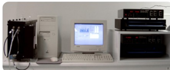
Figure 1. Alpha particle counters at Balazs laboratory

There are several different gas proportion alpha particle counters that can be used for testing the alpha emissions of materials. Balazs™ NanoAnalysis utilizes an ultra-low background counter with highest sensitivity. Solid samples up to 11 inches x 14 inches in size (or two 200 mm wafers) can be tested.