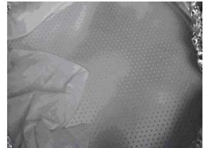
Figure 2. All tests described are applicable for ceramic showerhead