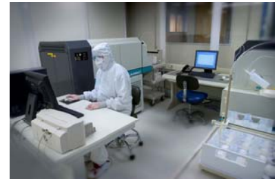
Figure 1. ICP-MS in Class 100 laboratory

Packaging is an integral component of the part, assembly or coupon. The rule of thumb for the cleanliness level of packaging film is it should be at least 3-5 times lower than the cleanliness specifications of the part to be packaged. Natural and antistatic polyethylene (PE) generally exhibit acceptable levels of ionic cleanliness and are generally shown to also be oil and amine-free. Most available films, including natural PE, are not adequate for packaging tool parts requiring very low levels of hydrocarbon contaminants. Identifying the purest materials through testing reduces added contamination from packing.