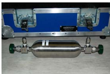
Fig 1. Balazs gas sampling cylinder

Inert 'bulk' gases comprise N_2 , O_2 , H_2 , Ar, He, CO_2 , and clean dry air (CDA). These gases are consumed in large volumes for purging, inerting, plasma generation, and chemical transport. Critical impurities in bulk gases (see, for example, ITRS Roadmap, 2008 Update, Table YE9) include moisture, O_2 , N_2 , CO, CO_2 , and hydrocarbons. Gas analysis can be done on-line to quantify impurities at pptV to low-ppbV concentrations, or off-line, utilizing 'grab sampling' methods, to achieve low-ppbV reporting limits. Metal impurities in bulk gases exist in the form of non-volatile particles, which are efficiently removed by current particle filtration technology. Balazs focuses on off-line analysis of bulk gases via portable gas cylinders (see Fig. 1), and a broad array of analytical tools, including gas chromatography mass spectrometry (GC-MS) and Fourier-transform infrared spectroscopy (FTIR). This approach allows bulk gases at any location to be rapidly and cost-effectively sampled and analyzed using state-of-the-art laboratory equipment.