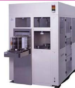
Automated VPD ICP-MS

Balazs uses Vapor Phase Decomposition for metal collection from the wafers followed by Inductively Coupled Plasma Mass Spectrometry (VPD ICP-MS) for critical surface contamination measurement. This multi-element survey provides low detection limits ( 10^8 to 10^{10} atoms/cm 2 ) for not only heavier transition elements that affect wafers, but also for lighter elements such as Na, K, Al, Mg that can be mobile ions or affect gate oxide integrity. This test can be used to measure trace surface metal concentrations on silicon wafer surfaces and in dielectric thin films. When contaminants are found, similar extractive test methods can also be used to determine contaminant levels on parts or wafer handling equipment.